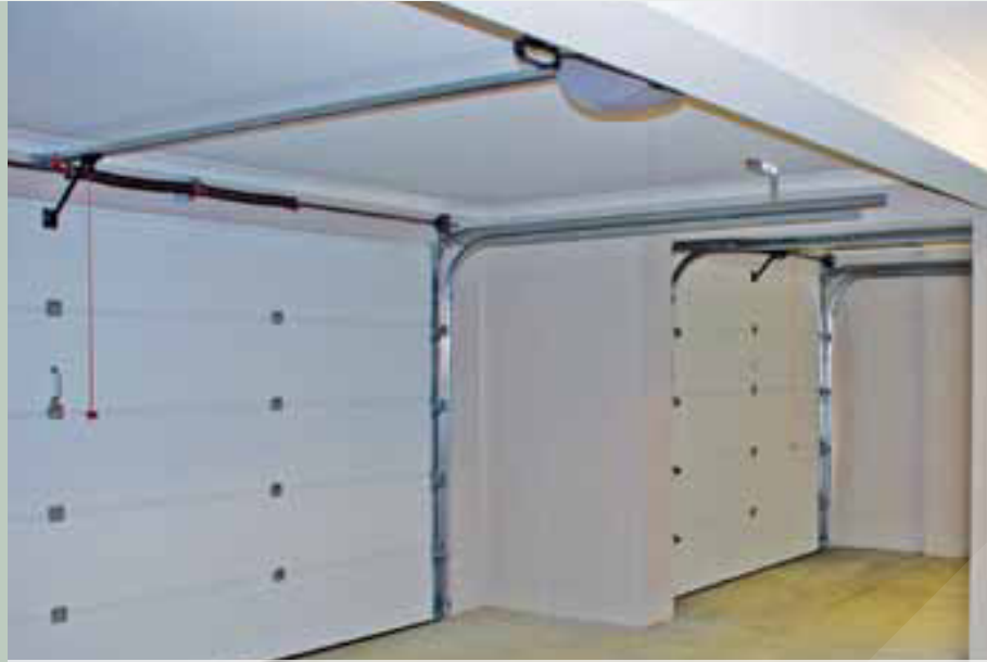
INSIDE OF GARAGE DOOR SHOWING FRAMELESS APPEARANCES